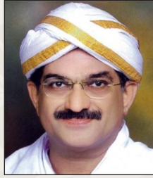
Poojyashri Dr. D. Veerendra Heggade